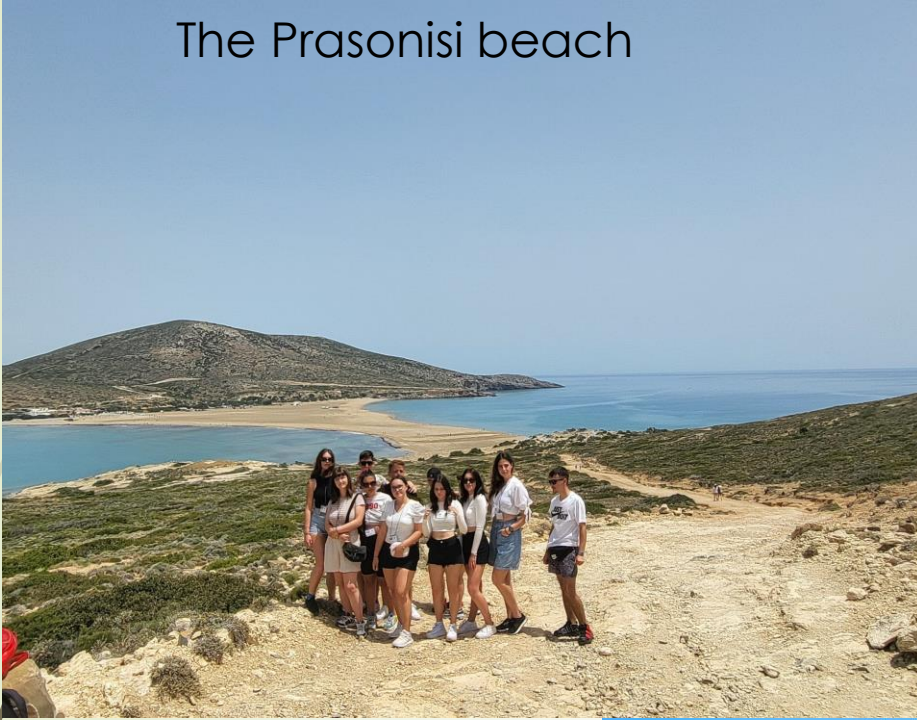
The Prasonisi beach