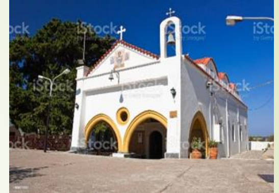
The Tsambica Monastery