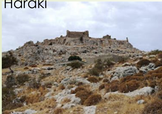
The Feraklos Castle, Haraki