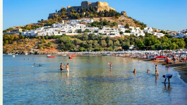
The Lindos Beach