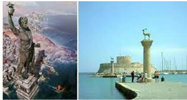
The Colossus of Rhodes